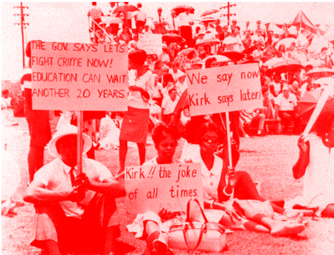
Florida — Teacher Walkout 1968

Teachers as a whole felt like they were being taken advantage of, and felt as though they were expected to do extraordinary work with very little support from local governments. It is what eventually convinced them to form unions, although unions were traditionally associated with more hard-labor jobs. The agonizing conditions of their employment are what convinced them that teachers needed to band together in order to gain leverage when it came to negotiating better working situations. The organization of unions took place in urban cities, but grew over the years to represent teachers nationwide.