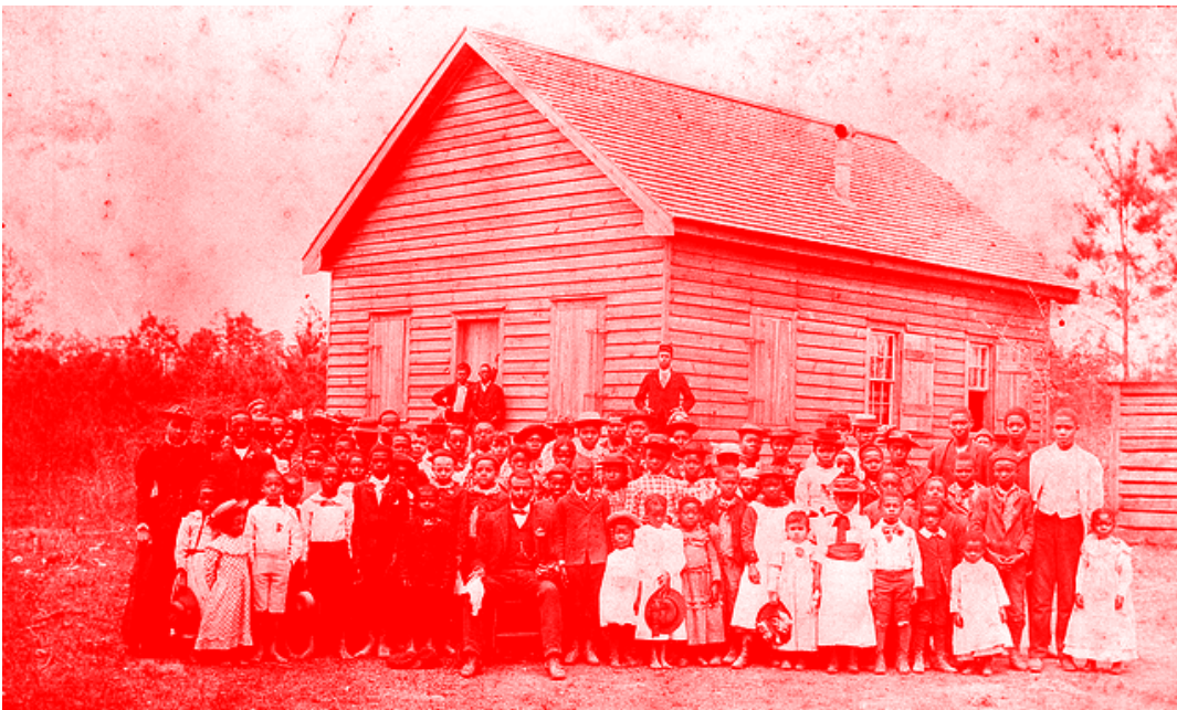
North Carolina — A segregated early American schoolhouse Early 1900s

The schoolhouse was not spared from the changes of society. Modern American public schools began to morph into the shape it is in now, developing many of the problems we still find, and suffer from, today. These problems include a lack of resources for classroom activities, overcrowded classrooms (students filling schoolhouses to the brim), dismal pay, and teachers feeling like they had no freedom of movement in the curriculum they would teach their students. Students had to learn within dilapidated building structures, many of them, because of the many new immigrants, did not speak English, and couldn’t communicate with their teacher or peers.