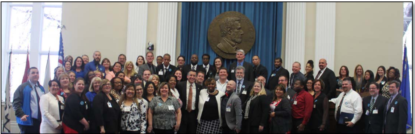
2017 CCEA Lobby Day, Carson City, Nevada